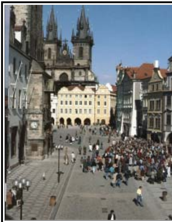
Prague, Old Town Square

For the conference program and the planned pre- and post conference activities refer to details in this and the previous (Fall 2004) NEWSletter.