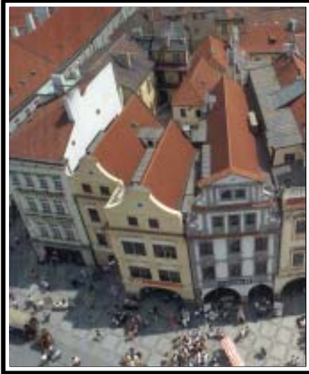
Prague - Old Town Square

The music of Dvorak's friend, Leos Janacek (1854—1928), a fervent