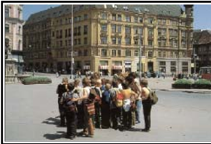
Brno - already an important town in the Middle Ages

among surrounding churches. Three of them, the Agony in the Garden , the Entombment and the Resurrection survive and are now in the National Gallery in Prague. The works of the Trebon Master are impressive for their novel effects of light and shade, the elongated proportions of the figures and the gentle fall of the draperies; they mark a preliminary stage in the development of the the ' Schoener Stil ' (International Style). This style influenced art throughout Europe around 1400; another celebrated example is the Madonna