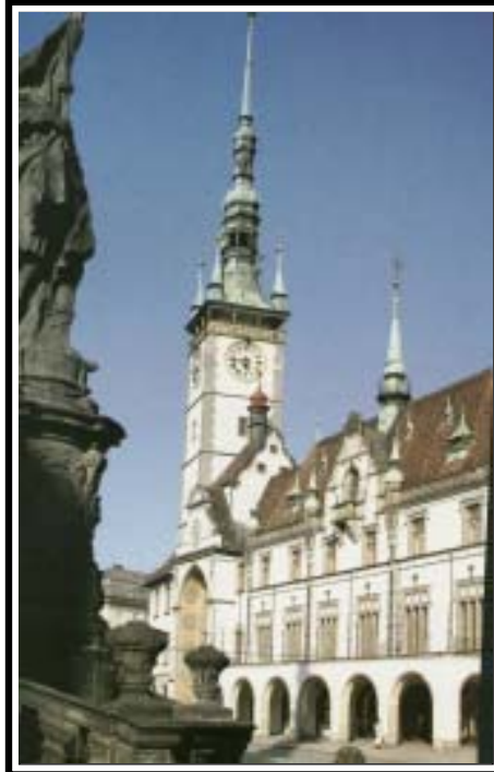
Namest nad Oslavou

When the last Prince Eggenberg died in 1717, his widow Maria Ernestine, Princess Schwarzenberg , inherited the property. From then on the Schwarzenberg family ruled at Krumau , until in 1947 ownership of the castle was transferred to the town and it has since served as a museum/archive.