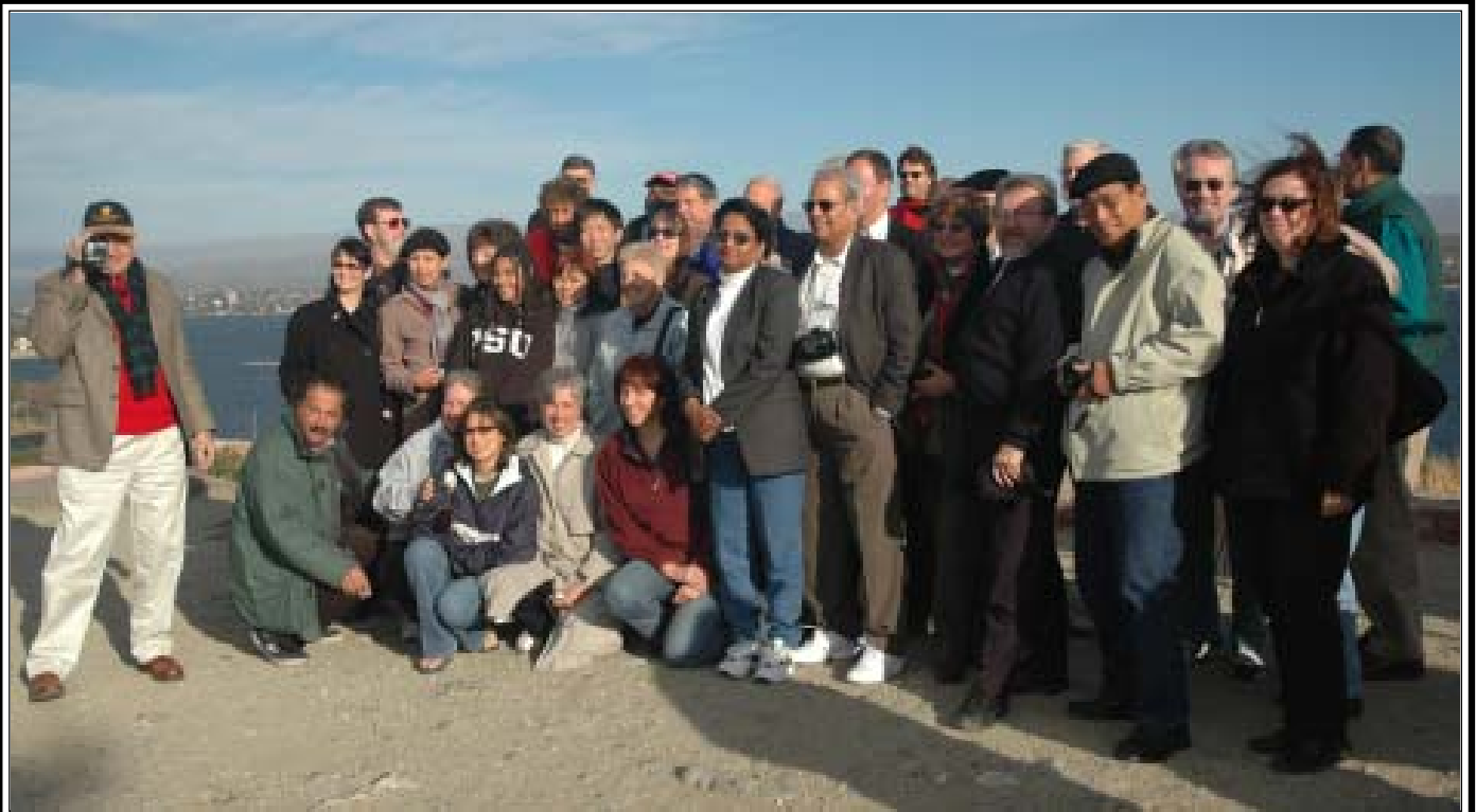
WACRA 2004 Educational - Cultural Post Conference Tour Buenos Aires - Las Pampas - Cordoba

Receipt of all proposals/papers will be acknowledged and the results of the review will be send by way of e-mail. All proposals and papers are due on or before January 15, 2005. Completed papers received prior to March 31, 2005 will be considered for publication