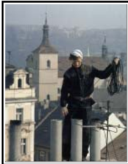
'Sur les toits de... Prague'