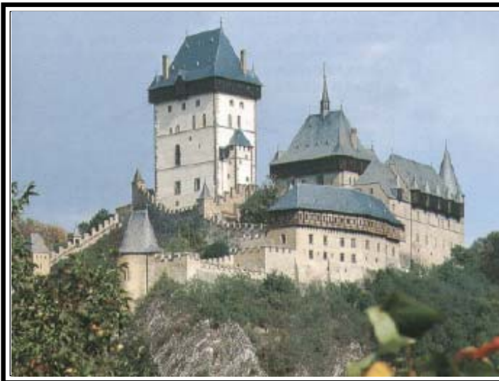
Karlstejn Castle - one of the most perfect castles in Europe

many fishponds which are still a feature of the landscape around Hluboka . The complications of Bohemian history ensured a rapid turnover of owners until in 1661 Johann Adolph von Schwarzenberg , who was made a Reichsfuerst (prince of the Empire) in 1670, acquired Frowenburg ' (the name is derived from 'Fronburg'). The Schwarzenbergs stayed here until 1945, providing diplomats, ministers and soldiers to the Habsburgs and beyond: Vaclav Ravel's chancellor was the present Prince Schwarzenberg . Frauenberg was the main