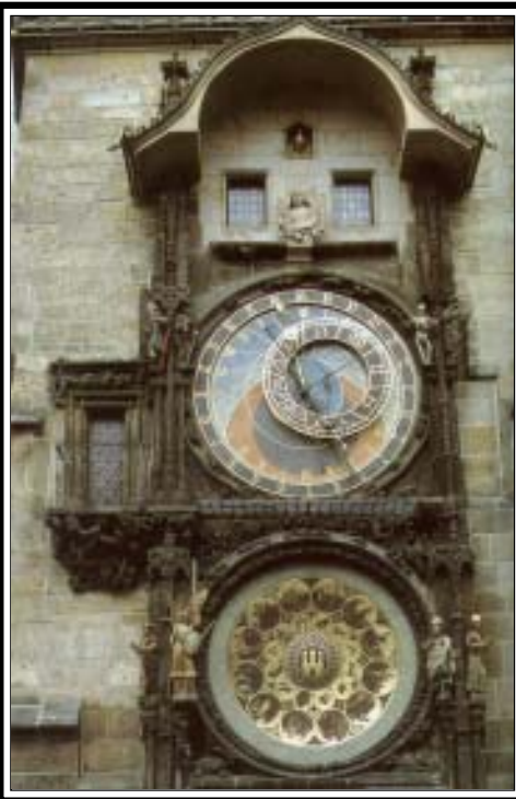
Prague - Astronomical Clock

The nucleus of the city is the Old Town ( Stare mesto ). The other old districts — Mala Strana (Lesser Town; German: