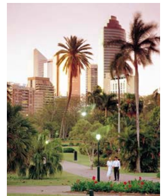
QUT, your WACRA 2006 Conference host university is adjacent to the City Botanical Gardens.